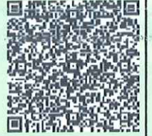
Prof.Incharge Sukhdeo Sahay Madheshwar Sahay Degree College Tarhasi,Palamau

This Receipt is to be used as proof of payment of stamp duty only for one document. The use of the same receipt as proof of payment of stamp duty in another document through reprint, photo copy or other means is penal offence under section-62 of Indian Stamp Act, 1899